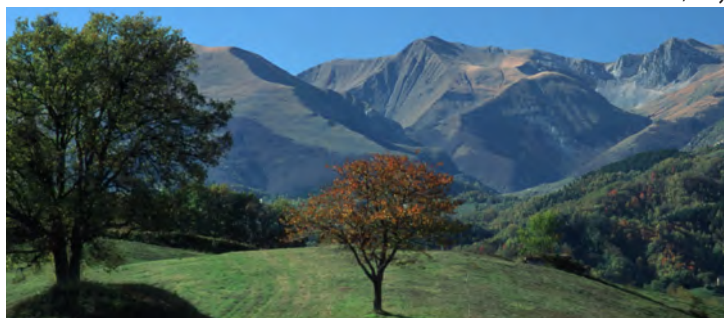
Monti Sibillini National Park, Italy

The Monti Sibillini National Park (MSNP) is a public authority - controlled directly by the Ministry of Environment and Territory. It was founded in 1993, as part of the Apennines, covers a territory of 70.000 hectares. MSNP is an important mosaic of natural habitats which are home to over 60 species of Community Interest. There are 18 pSCI (proposed Sites of Community Interests) and 5 SPAs (Special Protected Areas) that cover 77% of the whole surface