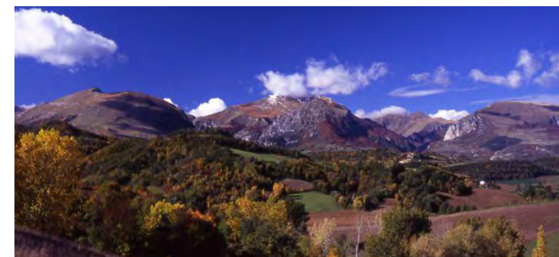
Province of Macerata, Italy

The Province of Macerata consists of 57 municipalities and 3 mountain communities (Mountain community of San Severino, Mountain community of Monti Azzurri, Mountain community of Camerino).