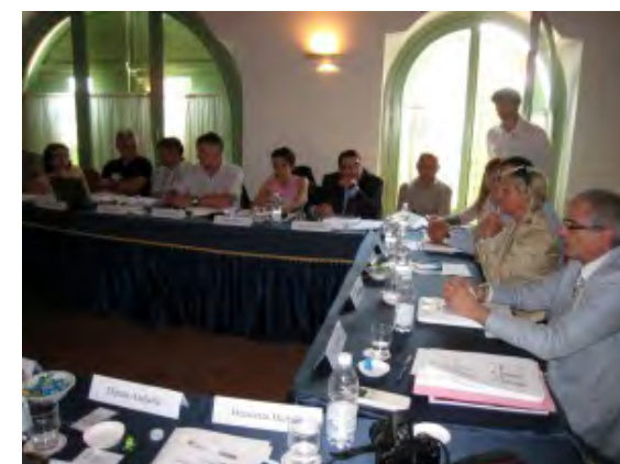
Transnational project team

Nel corso del meeting ogni partecipante ha illustrato la situazione esistente nei rispettivi contesti locali in ambito ambientale-montano a cui ha fatto seguito un approfondimento delle tematiche relative al monitoraggio, pianificazione e promozione delle attività progettuali con una suddivisione dei ruoli e delle responsabilità da parte di ciascun ente partner. Per il territorio maceratese figurano, ad esempio, anche lo sviluppo di azioni volte a qualificare l'agriturismo e un'iniziativa per diffondere e disciplinare sui Monti Sibillini la coltivazione della “Genziana”, pianta officinale utilizzata pure come aromatizzante in alcuni prodotti realizzati da una antica e famosa distilleria, apprezzata e conosciuta in Italia e all'estero. Durante il meeting maceratese sono stati costituiti anche tre gruppi di lavoro che si occuperanno di tematiche riguardanti la protezione e la valorizzazione delle aree montane. In occasione del prossimo meeting, in programma a fine settembre in Bulgaria, i tre gruppi presenteranno una prima proposta rispettivamente per quanto riguarda attività e prodotti sostenibili dal punto di vista economico; metodi di gestione coordinata ed integrata; strategie per l'informazione e la formazione.