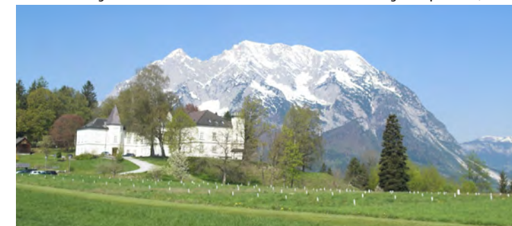
Agricultural Research and Education Centre Raumberg-Gumpenstein, Austria

The Agricultural Research and Education Centre Raumberg-Gumpenstein (AREC) is a research entity of the Austrian Federal Ministry of Agriculture, Forestry, Environment and Water Management (BMLFUW – http://www.lebensministerium.at ). It is well-positioned in the research area of cultural landscape, grassland ecology and organic farming. The strategic aim is to develop alternative systems for landscape protection and conservation and to develop indicators for an ecologically sound development of cultural landscapes, especially in mountain regions.