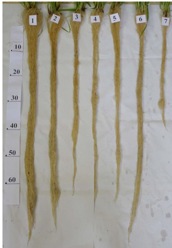
Figure 1: Root system size of various spring wheat varieties in hydroponics experiments (1, Zuzana; 2, Amaretto; 3, Septima; 4, Granny; 5, Frontana; 6, Bárbaro-B; 7, Bhouth 4)

These seven varieties and 20 breeding lines of their crossing progenies were sown at three sites (Chlumec nad Cidlinou, Hustopece, Uhretice) from 2010 to 2012. Each variety and line had 40 plants. The electrical capacity of RSS was measured on 24 plants. The first measuring was carried out during stem extension (DC 34-43), the second during hea-