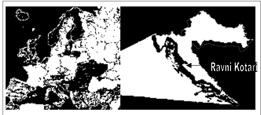
Figure 1: The position of Ravni Kotari in the Croatia.

During the hydrogeological study of the area, were taken samples of water from springs: Turanjsko lake, Kutijin stan, Biba, Begovaca and channel Kotarka. Also, were taken samples of soil through the profiles at the five locations around the water supply pumping station Turanjsko lake. In all those samples were measured next geochemical indicators: \text{NO}_3\text{-N} , \text{NH}_3\text{-N} , \text{PO}_4^{3-} , \text{SO}_4^{2-} , Cl,