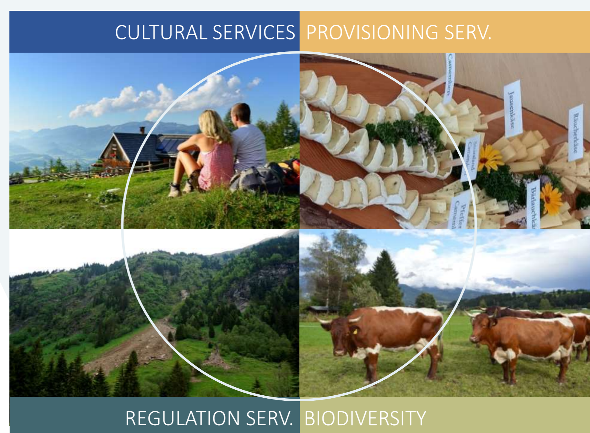
Figure 2 The indicators are built upon the concept of ecosystem services (ES). According to the CICES classification ES are divided into three groups: (I) provisioning services, like food production, (II) regulating services like soil conservation and (III) cultural services, such as recreation (CICES 2023). Biodiversity acts as a basic service for ecosystem services, like genetic diversity of plants and animals (Schwaiger et al. 2011).