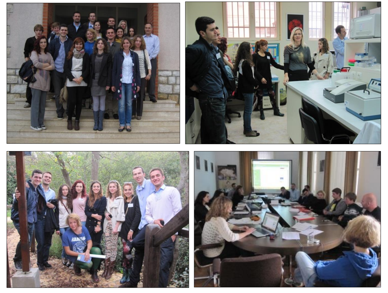
Figure 2: The second training was implemented in Poreč, Croatia in October 2013. Host was the Institute of Agriculture and Tourism (IPTPO).

For the future, the hosts AREC and IPTPO wish to have the opportunity to offer students from developing countries scientific and technical practice to get a broad few of innovation and state of the art know-how transfer in sustainable land management and to enhance the actual scientific network for young researchers and practitioners.