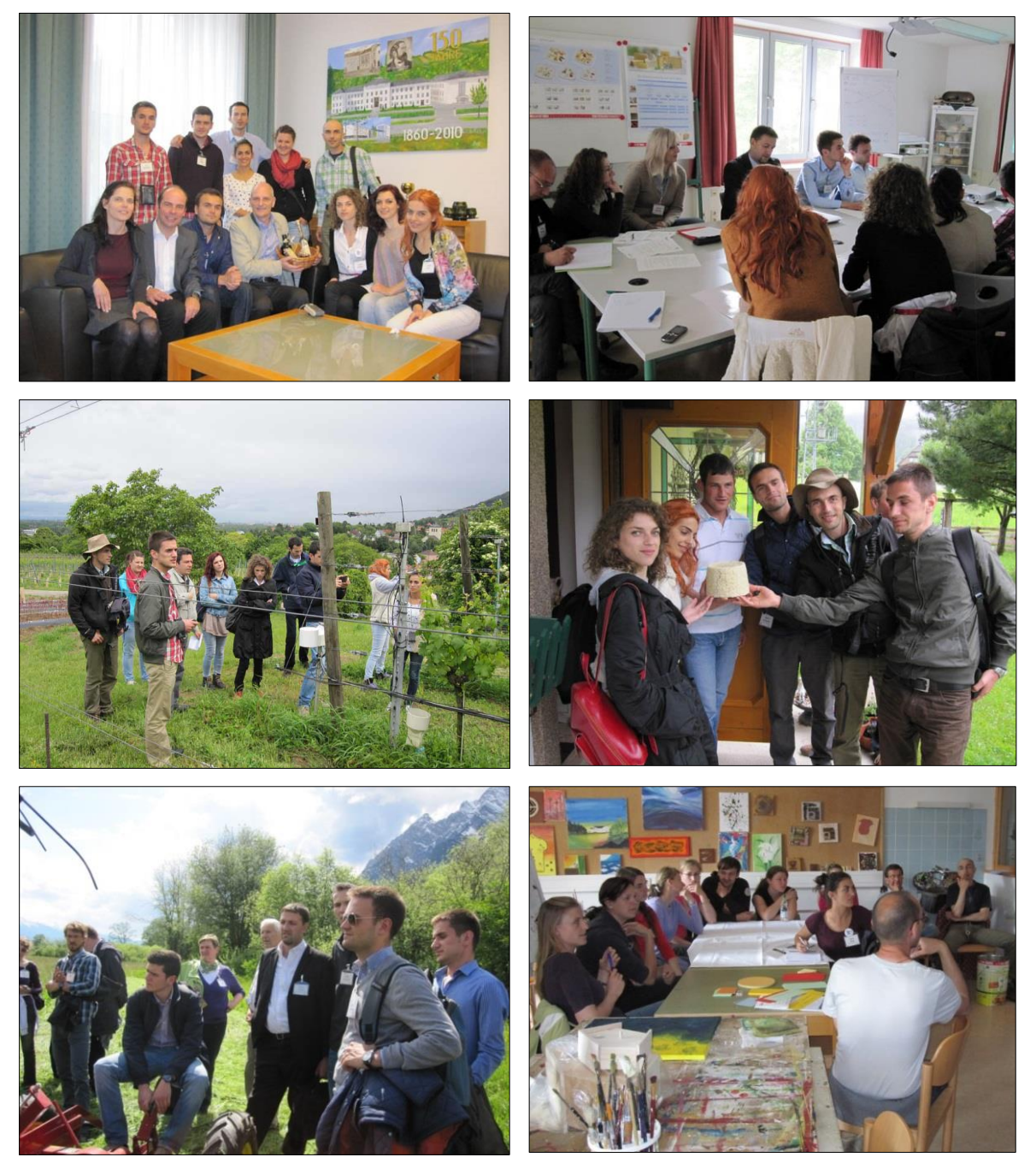
Figure 1: The first training took place at AREC Raumberg-Gumpenstein in Austria in May 2013.