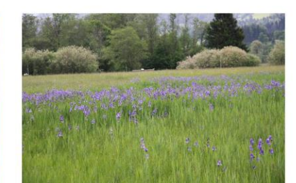
International "Biodiversity & LEADER" conference, April the 3rd, Vienna