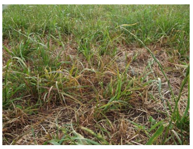
Figure 3: Necrotic and dead plants in a cultivated area of Italian ryegrass cv. 'Meroa RvP'

and cocksfoot in Japan by TORIYAMA et al. (1983). In Germany the virus was first detected in ryegrass breeding clones and in Bromus species (RABENSTEIN et al. 1998b). The occurrence of RgMoV in D. glomerata plants is new for Central Europe. There are no reports on yield losses caused by RgMoV infections in fodder grasses in the literature. Unexpectedly, however, the virus was found with high incidence in a cultivated area (17 ha) of Italian ryegrass ( Lolium multiflorum Lam.) cv. 'Meroa RvP' last year at one location in Saxony-Anhalt in Germany ( Figure 3 ). A more detailed analysis revealed that more than 60% of the plants in the field grown for dairy cattle feeding were infected by RgMoV causing a considerable reduction in yield and forage quality.