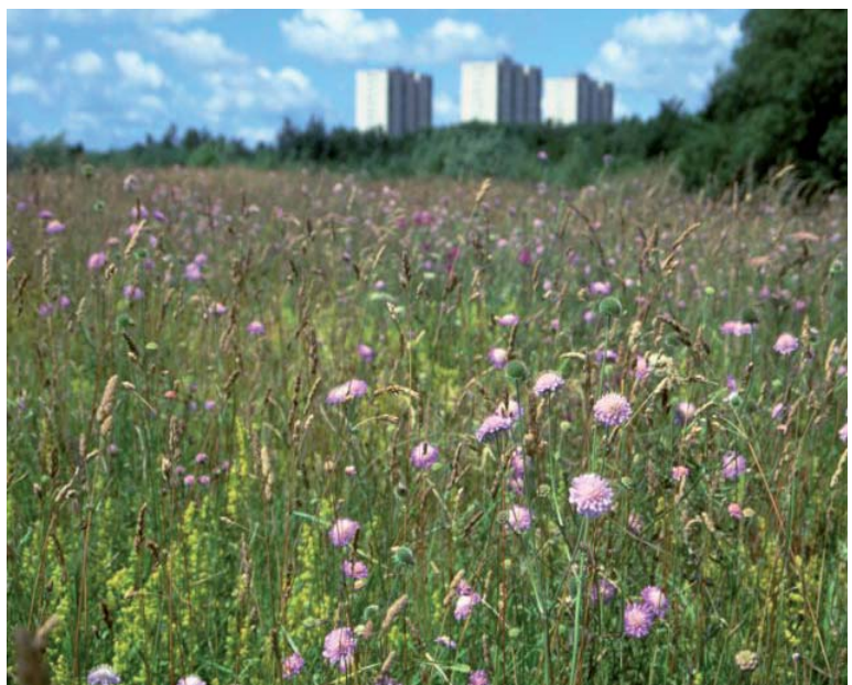
Woolfall Heath, Huyton. Sustainable landscape delivery on Merseyside

servation policy in May 2000, and continue to challenge traditional ways of working. Landlife enables other organisations and communities to deliver ecologically especially in areas with low ecological potential and low aspirations of ecological landscape delivery.