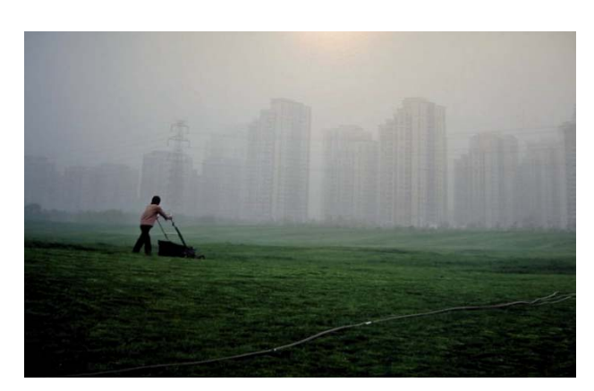
What awaits us? As the world becomes increasingly urbanised, aspirations for landscape practice need to be raised as a matter of urgency.