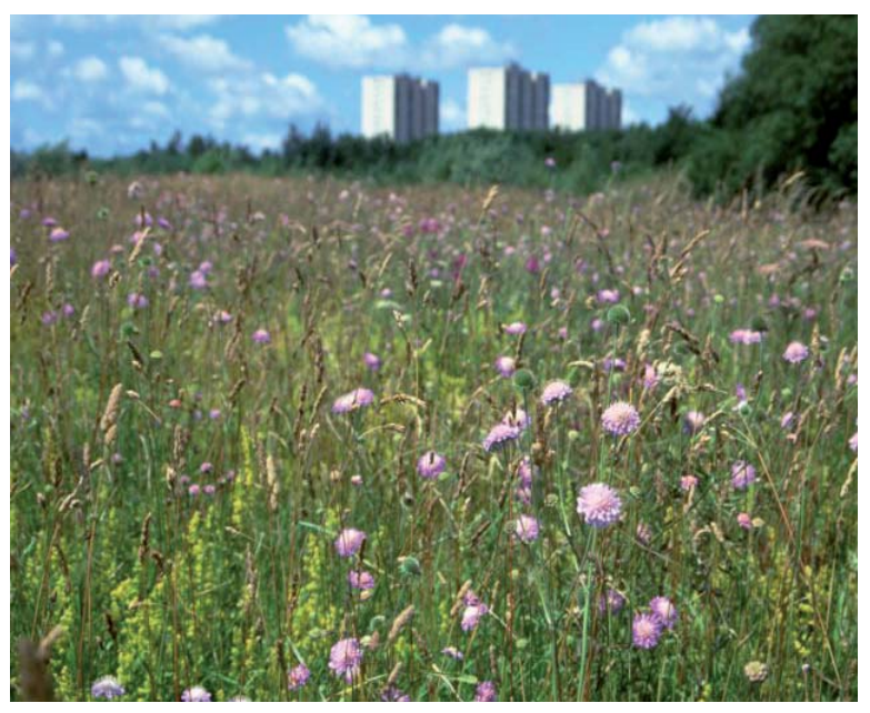
Woolfall Heath, Huyton. Sustainable landscape delivery on Merseyside

Landlife organised the first UK conference on climate change and its implications for con-