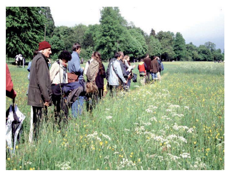
This presentation will demonstrate Landlife's experience in the realm of the semi-natural grassland delivery, and illustrate the important concept of creativity in response to a changing world and considerable environmental and social need. The opportunity of nature is reflected in the potential of seed and how it is used. This takes on board the Parable of the Leaning Tower of Pisa and the Accidental Rainforest, and lessons from the world's oldest grassland experiment.