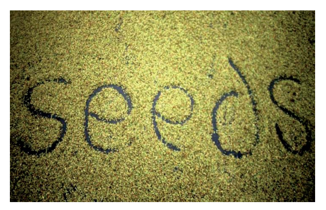
Seeds represent potential and their resource should be used wisely, the starting point of projects is therefore critical.