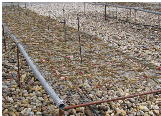
Figure 2: Irrigation of spikes