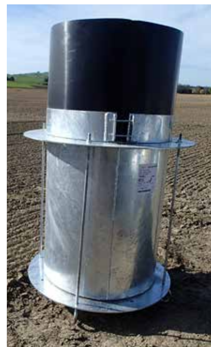
Figure 3: Arable lysimeter during design and after fabrication. The standard soil monolith lysimeter (500 mm diameter, 700 mm deep) was modified by the addition of a 400 mm polyethylene upper rim and clamp.