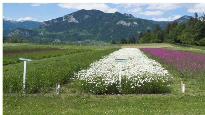
Propagation of local seeds on small scale

Selected material is reproduced by farmers on a larger scale for restoration activities. So genetic resources of autochthonous grassland species and crop wild relatives are conserved and seed material is available for restoration activities in the respective areas of origin.