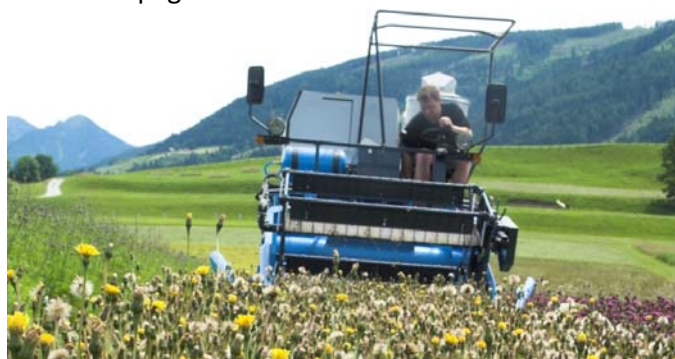
Harvesting on small scale