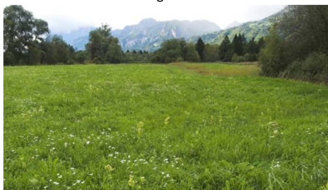
Establishment of abandoned land with local seeds before and 5 years after restoration (Ennsvalley, Styria)