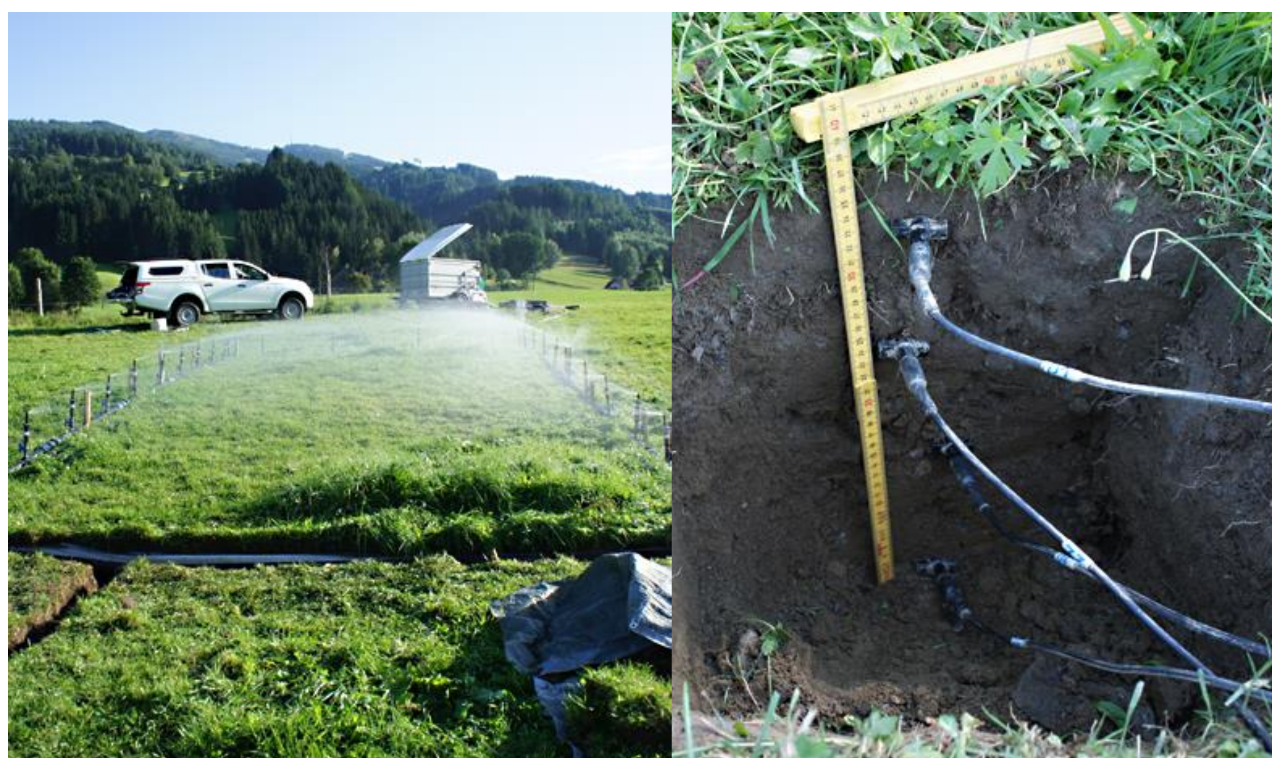
Figure 1: Measurement of surface runoff at five differently steep meadows and forest plots in the Upper Styrian Enns Valley.