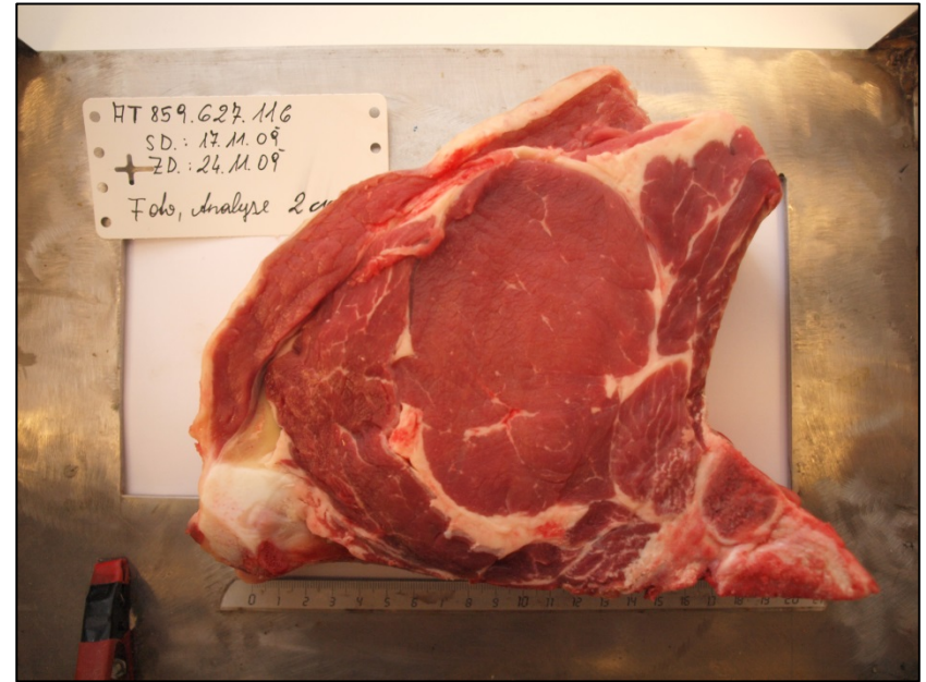
Entrecote of CHxSI heifer IMF content: 1.8%

In an organoleptic test meat of CHxWagyu and SIxWagyu crossbreeds was very tender and juicy and tasted marvellous.