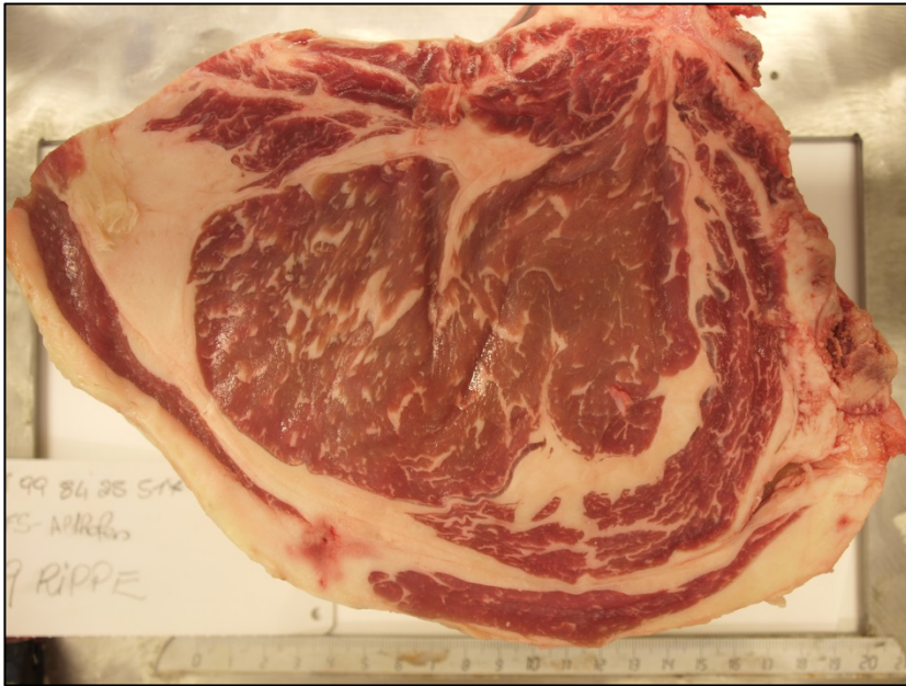
Entrecote of CHxWagyu heifer IMF content: 11.2%