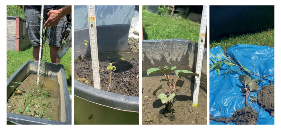
Figure 6 – From left to right: Goldenrod, Himalayan balsam, Japanese knotweed and roots/rhizome and stems of goldenrod & Japanese knotweed on 21 June 2023; Japanese knotweed and goldenrod, showing roots and leaves

The BAfEP students wrote their final-year dissertations in parallel to the development of the kits, as the