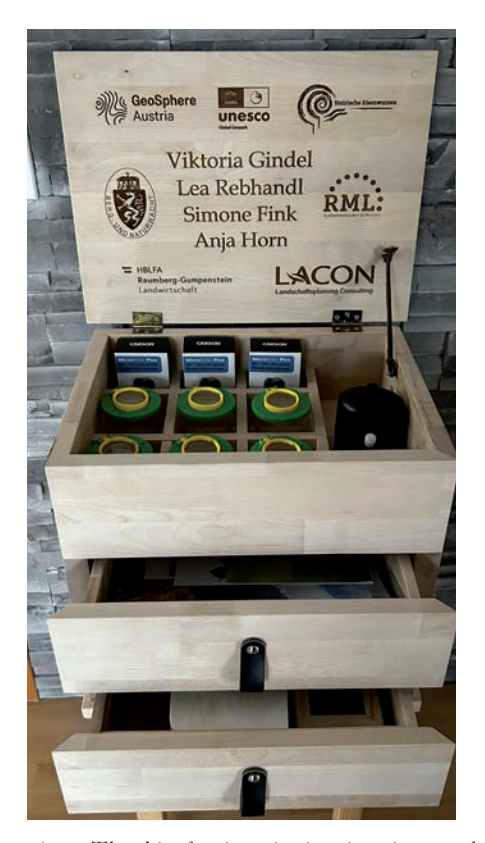
Figure 4 – The kit for investigating invasive neophytes.

monitoring. Within our project, we developed a new function specifically for observing invasive neophytes (Figure 3). All data gathered from the observation sheets and the Nature Calendar app were forwarded to GeoSphere Austria and are currently being stored in a database for future analysis as the data density and observation period increase. The information gathered will be of interest to a range of stakeholders, from climate scientists to biologists and medical professionals.