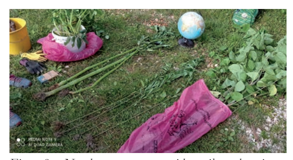
Figure 8 – Neophyte management with pupils at the primary school in Aigen.

tenmarkt primary school participants wondered what superpowers the neophytes might have – What can the giant hogweed do? – and designed posters, which were presented to the other students.