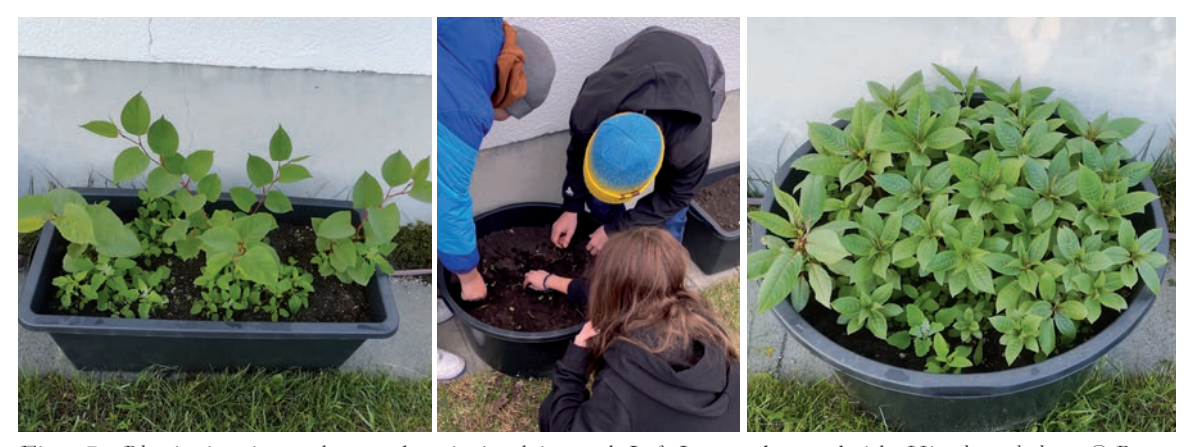
Figure 7 – Planting invasive neophytes, and monitoring their growth. Left: Japanese knotweed; right: Himalayan balsam.

young children tried out the experiments and games in school: "Discovering climate change with children aged 3–6 with the help of planning, observations and experiments in the Styrian Eisenwurzen region" (Jug et al. 2023), and "What's blooming? Research using plant newcomers from all over the world with children aged 3–6" (Gindel et al. 2023).