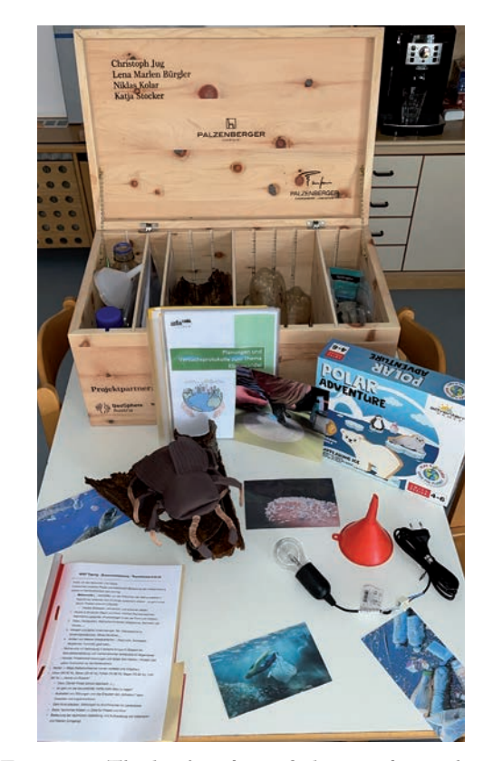
Figure 5 – The kit for relating findings to climate change.

An important aspect of the project was the involvement of students at the Bundes Bildungsanstalt für