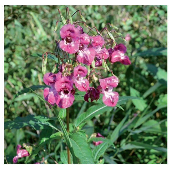
Figure 1 – Flowering Himalayan balsam (Impatiens glandulifera).

The plant species investigated were the Canadian and giant goldenrod ( Solidago canadensis , Solidago gi gantea ), ragweed ( Ambrosia artemisiifolia ), Himalayan balsam ( Impatiens glandulifera ), giant hogweed ( Heracle um mantegazzianum ), robinia / black locust ( Robinia pseu dacaciae ), and Japanese knotweed ( Fallopia japonica ) (Figure 1). For the purposes of this project, the two species of goldenrod were considered together. They were selected because most of them are already widespread in Styria (and Austria more widely), and they are easily recognizable for the general public. Four of these species were introduced as ornamentals; robinia / black locust is of forestry importance, while ragweed was introduced accidentally. Ragweed pollen causes res-