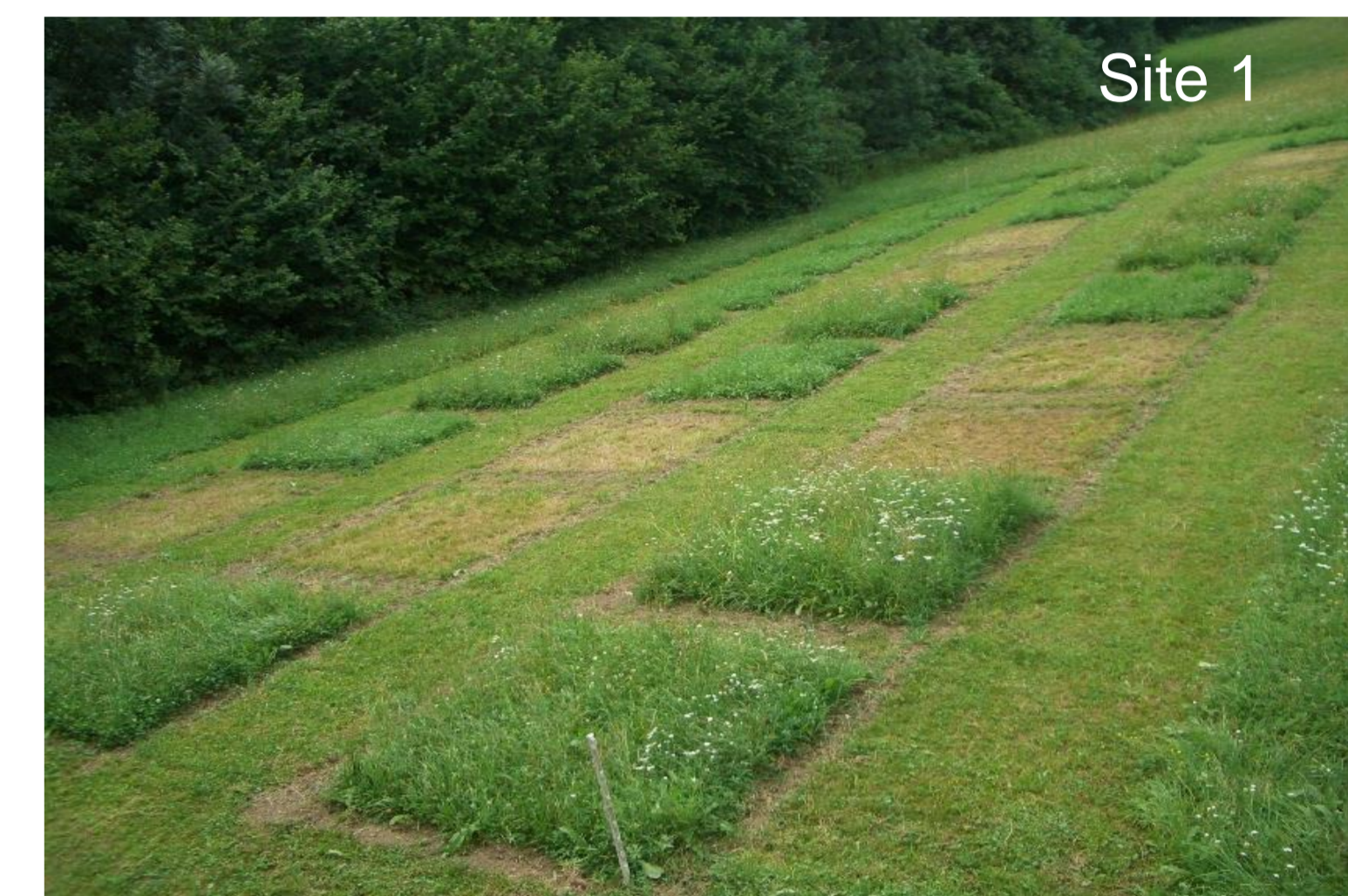
Figure 1: Two sites of investigation.