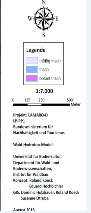
Fig.1: Forest Hydrotope Map, thematic layer "Water Regime Class" for the DWPZ part Steyr.