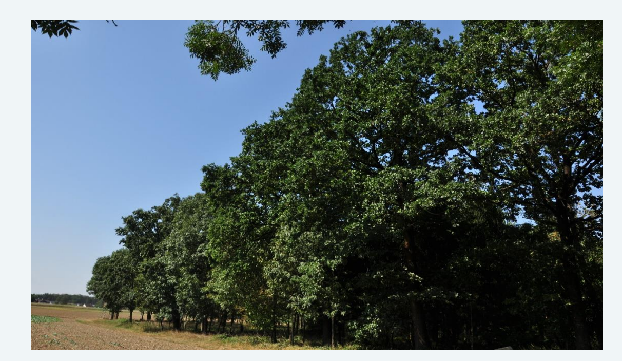
Pict: 1: Stable oak trees (Quercus robur) at the edge between forest and arable land in the DWPZ.