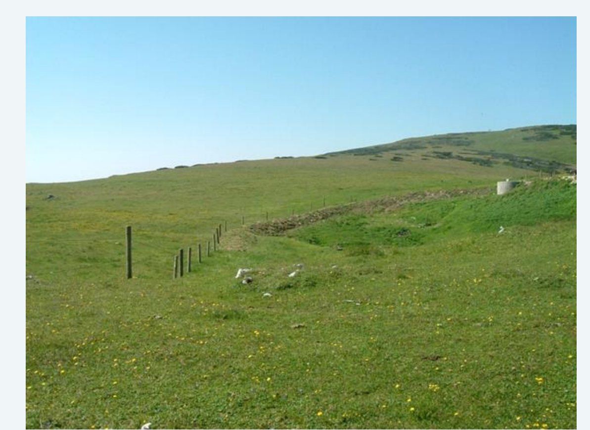
Pict. 2: Fencing of doline, embankments uphill; Schneealpe