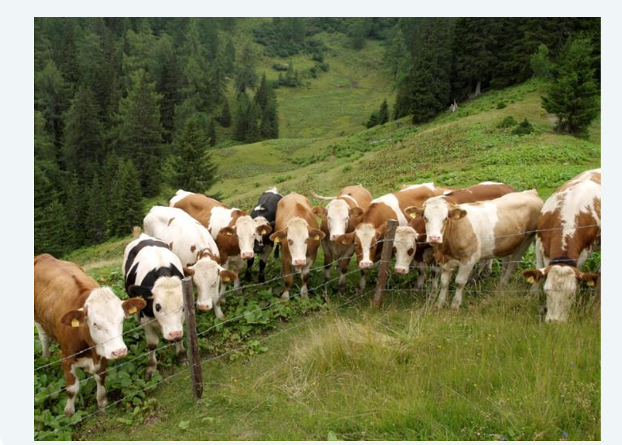
Pict.3: Alpine pasture Nat. Park Gesäuse, Blaschka, 2018